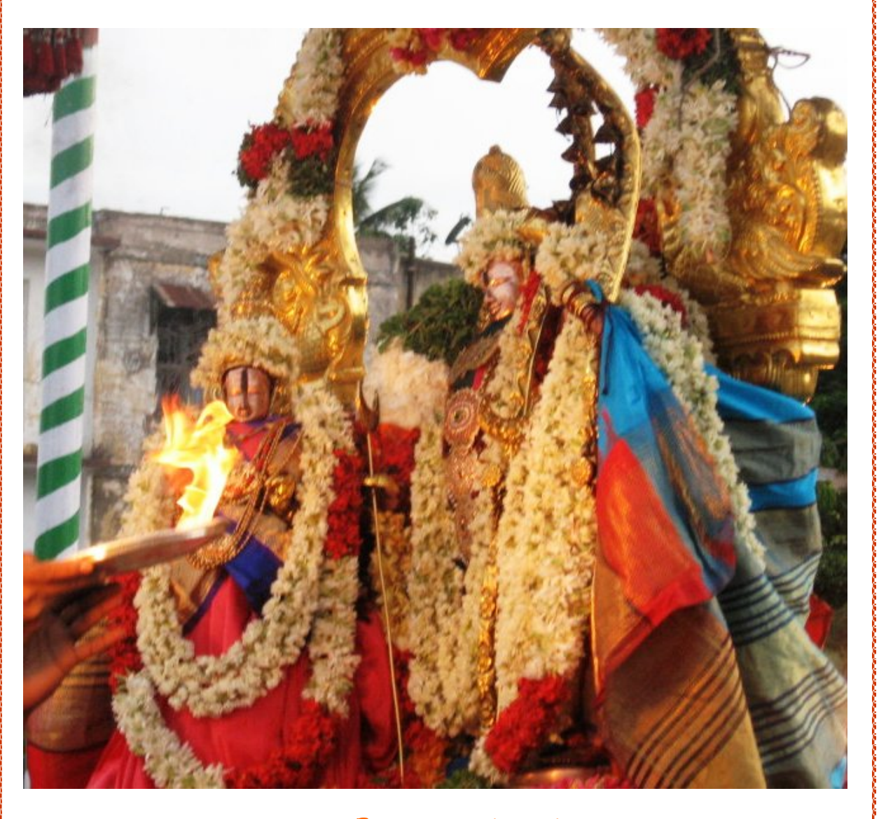
sarvESwaran at tirupati

aagaccha vishNO bhadram tE dishtyA prAptOsmi raaghava | bhrAtrbhi: saha dEvAbhai: praviSasva svakAm tanum || vaishNaveem tAmm mahAtEjastadvAkaaSam sanAtanam