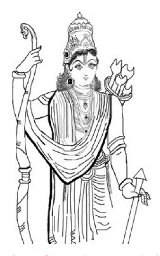
Even a blade of grass from His bow turns to brahmAstram

Even if the crow deserved to be killed, Lord Raamachandran spared its life because it had performed SaraNAgathy at His sacred feet.