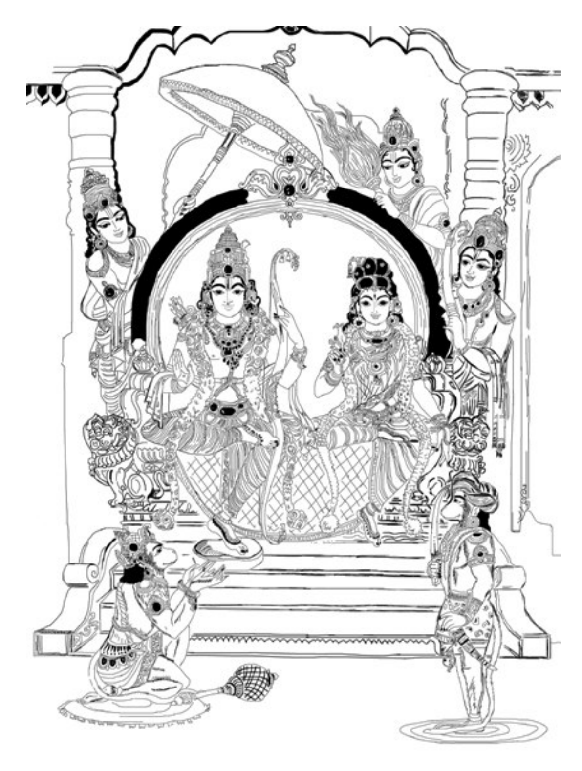
SrI rAmacandra parabrahmaNe namaH