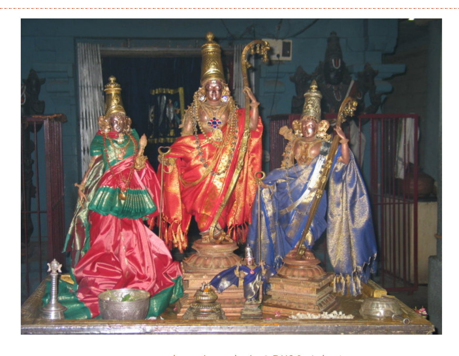
protector at madurantakam - thanks SrI VC\ G ovindarajan